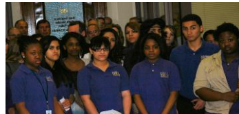
Students at State House hearing

the state's ELL population would be in jeopardy of not receiving a diploma, a shockingly high percentage.