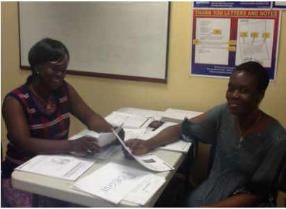
The Author, left, with a student

(she is a Muslim) in Liberia where she only learned how to read and write in Arabic. Her first English reading and writing lessons took place in her US high school's ESL pull out program. "I struggled with all subjects because everything was new to me, the letters, words, spelling...and I was placed in 11th grade!" she confided. Her main educational challenges in Liberia were the numerous interruptions of schooling due to the civil wars that started in the 1980s and continued into 2003. However, education in the US has a whole range of novelties she was not sure how to figure out. To the question of what the most difficult subject was, she answered "writing" because she struggled with spelling the most.